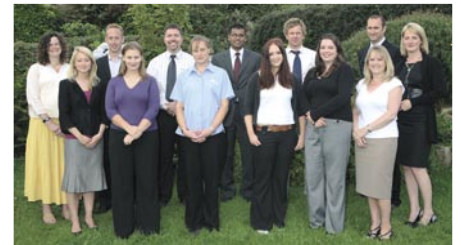
SITA Cornwall's new management and administration recruits

Alongside this, as a result of a review of working practice and after personal development discussions, critical training needs were also identified and provided for 240 employees, which has resulted in the company completing 650 days training.