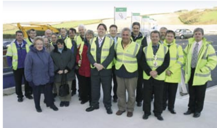
The official opening of the refurbished Bude HWRC

Facilities are now cleaner and much safer for employees and visitors and there has been a large decrease in the number of accidents.