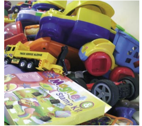
A selection of toys collected for the appeal

The unwanted toys, which might otherwise have ended up in landfill, were distributed by Helpline volunteers to health workers, social care teams and family centres, who passed on the toys to under-privileged children.